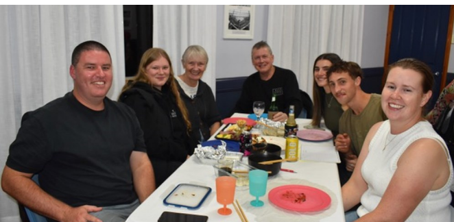
The winning table — 'The Train Wreckers'

Overall a great night was had by everyone and thanks to our wonderful sponsors 50 prizes were able to be shared amongst the players. The sponsors are all local family