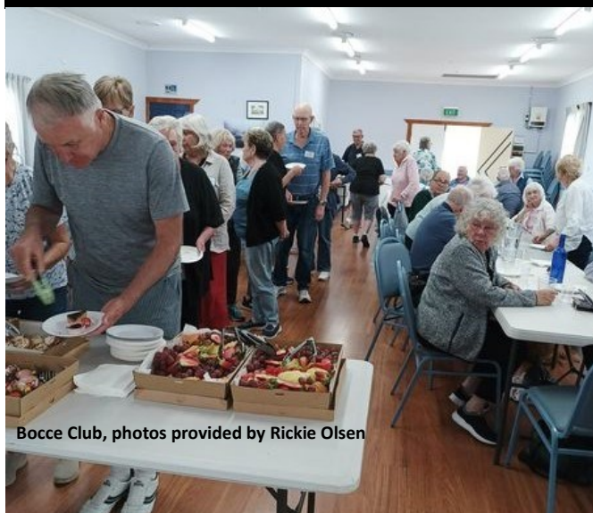
Bocce Club